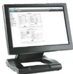
FRONT DESK MANAGEMENT