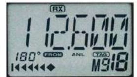
CDI mode display

The IC-A24 has VOR navigation functions. The DVOR mode shows the radial to or from a VOR station and the CDI mode shows the course deviation to/from a VOR station. You can also input your intended radial to/from the VOR station and show the course deviation on the display. In the USA version, the duplex operation allows you to call a COM channel, while you are using VOR navigation. (* IC-A24 only)