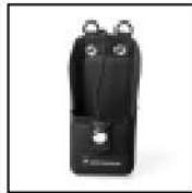
Carry Case HLN9701