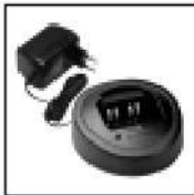
Rapid-rate Desktop Charger PMTN4025