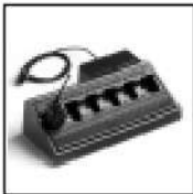
Multi-unit Charger PMTN4028