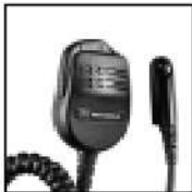
Remote Speaker Microphone PMMN4002