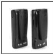
NiMH Battery & Belt Clip PMNN4008